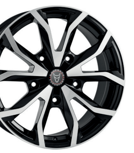
Assassin TRS Gloss Black / Polished 8.0x18″