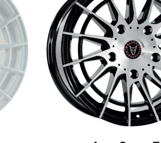
Aero Super T Gloss Black / Polished 8.0x18″