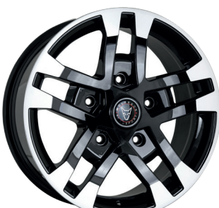
Assassin FTR Gloss Black / Polished Tips 8.0x18"