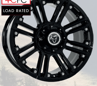
Amazon Matt Black Black Rivets 9.0x18" 9.0x20"