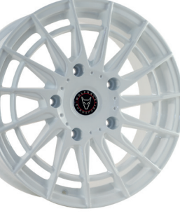
Aero Super T Gloss White 8.0x18″