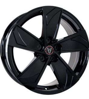
AD5 T Gloss Black 8.0x18″