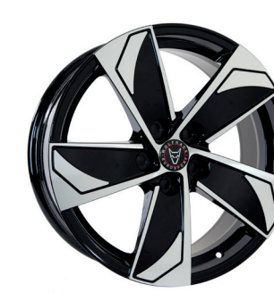
AD5 T Gloss Black / Polished 8.0x18″