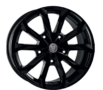
Assassin TRS Matt Black 8.0x18″