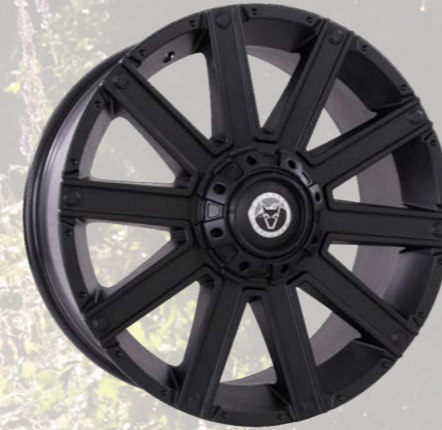
Kalahari Matt Black 9x20"