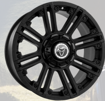
Amazon Matt Black / Black Rivets 9x18" 9x20"