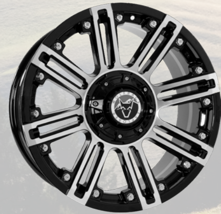
Amazon Gloss Black / Polished 9x18" 9x20"