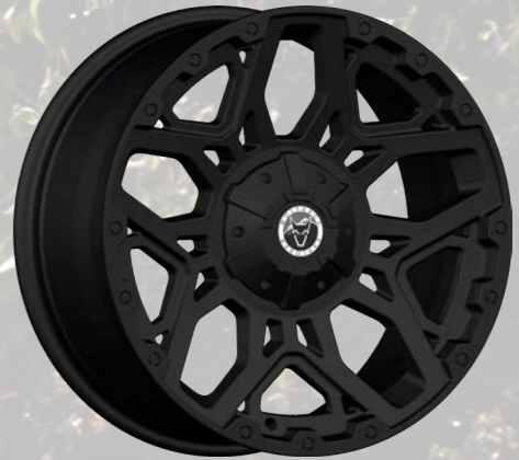
Sahara Matt Black 8.5x17" 9x20"