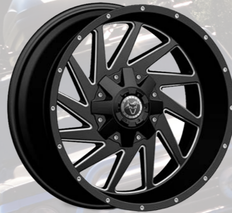
Wildtrek Gloss Black / Polished Windows / Milled Rim Holes 9.0x20"