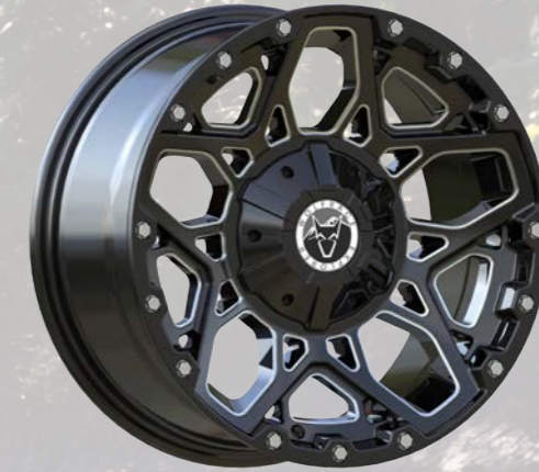
Sahara Gloss Black / Polished 8.5x17" 9x20"