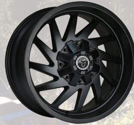
Wildtrek Matt Black 9.0x20"