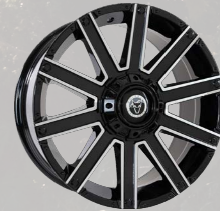
Kalahari Gloss Black / Polished 9x20"