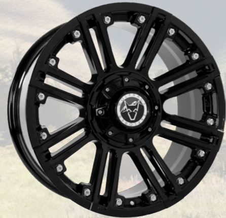
Amazon Gloss Black / Chrome Rivets 9x20"